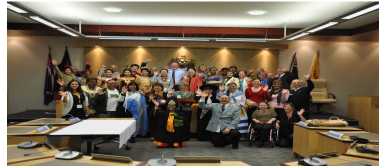
An Hour with the Mayor" ( actually nearly 3 hours!) Community Ethnic Leaders meet Gosford City Mayor, Laurie Maher .